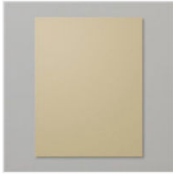
Crumb Cake 8-1/2" X 11" Cardstock - 120953