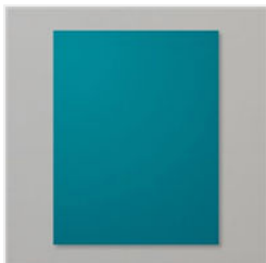
Pretty Peacock 8-1/2" X 11" Cardstock - 150880