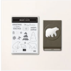
Beary Cute Bundle (English) - 162023