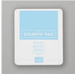
Balmy Blue Classic Stampin' Pad - 147105