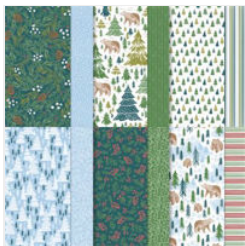
A Walk In The Forest 12" X 12" (30.5 X 30.5 Cm) Designer Series Paper - 162377