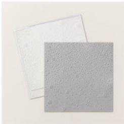
Snowflake Sky 3D Embossing Folder - 162026