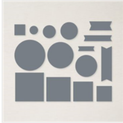
Stylish Shapes Dies - 159183