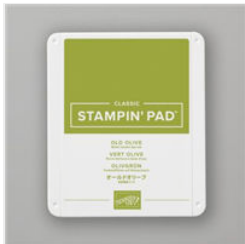
Old Olive Classic Stampin' Pad - 147090