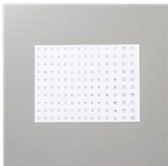
Rhinestone Basic Jewels - 144220