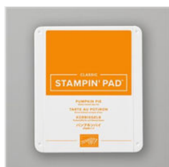
Pumpkin Pie Classic Stampin' Pad - 147086