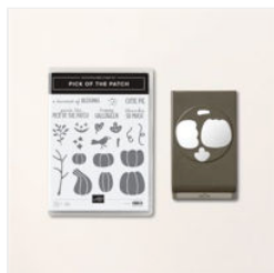
Pick Of The Patch Bundle (English) - 162201