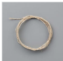
Linen Thread - 104199