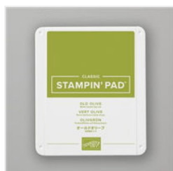
Old Olive Classic Stampin' Pad - 147090