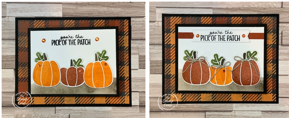
Simple Version and Stepped Up Version