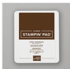
Early Espresso Classic Stampin' Pad - 147114