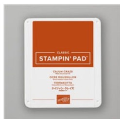
Cajun Craze Classic Stampin' Pad - 147085