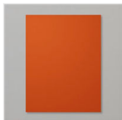
Cajun Craze 8-1/2" X 11" Cardstock - 119684