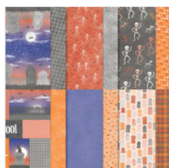
Them Bones 12" X 12" (30.5 X 30.5 Cm) Designer Series Paper - 162215