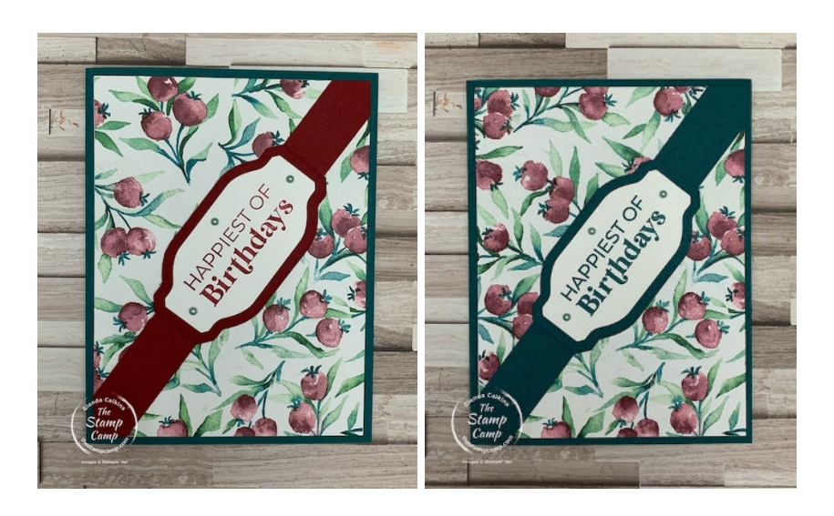
Create 1 Bonus Card with Winter Meadow Designer Series Paper

All images © 1990 - 2023 Stampin' Up!® All cards designed by Glenda Calkins of The Stamp Camp