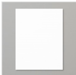
Basic White 8-1/2" X 11" Cardstock - 159276