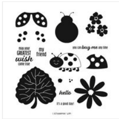
Hello Ladybug Photopolymer Stamp Set (English) - 157693