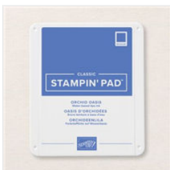
Orchid Oasis Classic Stampin' Pad - 159214