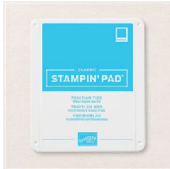
Tahitian Tide Classic Stampin' Pad - 159210