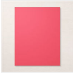
Sweet Sorbet 8-1/2" X 11" Cardstock - 159268