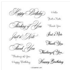
Go To Greetings Cling Stamp Set (English) - 158763