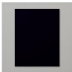
Basic Black 8-1/2" X 11" Cardstock - 121045