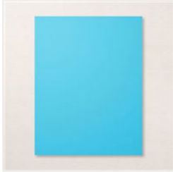
Tahitian Tide 8-1/2" X 11" Cardstock - 159261