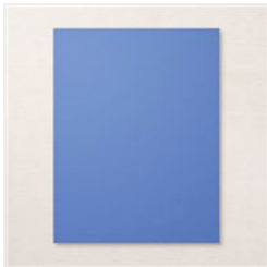
Orchid Oasis 8-1/2" X 11" Cardstock - 159267