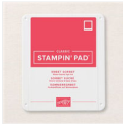
Sweet Sorbet Classic Stampin' Pad - 159216