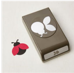
Ladybug Builder Punch - 157698