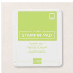
Parakeet Party Classic Stampin' Pad - 159208